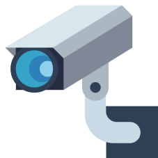
Full Security Cameras