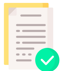
Tailored rental terms